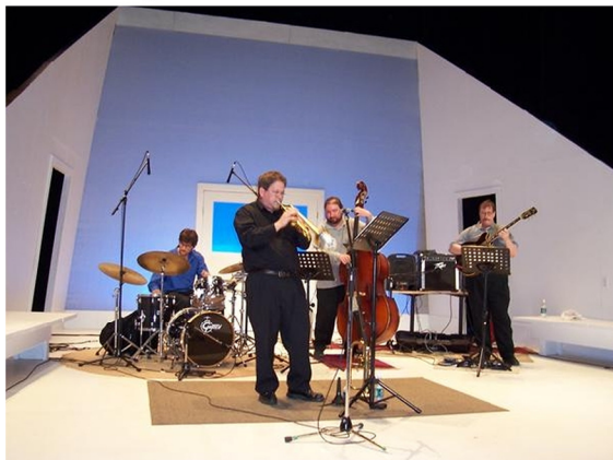
Ocean Sounds Quartet

The Ocean Sounds Quartet started in summer of 2004 with its inaugural concert at the Ship's Company Theatre on the Fundy coast of Nova Scotia. The band returned for a live concert recording in 2005 and then took a hiatus for the members to peruse other projects. Reforming in 2011, the release of the band's first recording, Live at the Ship's Company Theatre , trumpets the return of the Ocean Sounds Quartet to Atlantic Canadian stages.